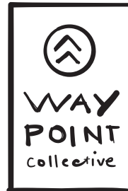
Strategic and creative branding solutions