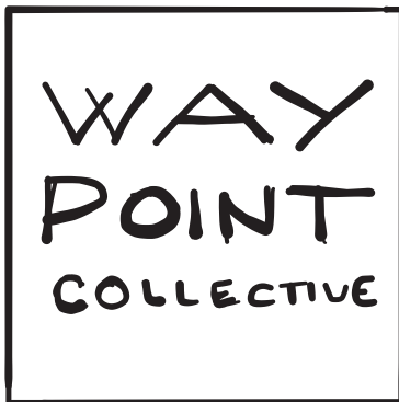
Strategic and creative branding solutions